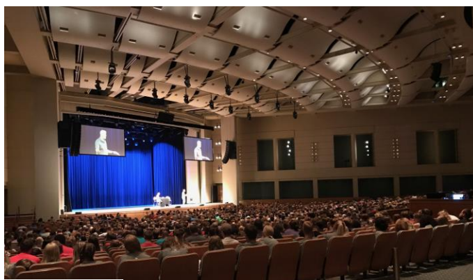
(Above) One of our daily, morning bible studies.