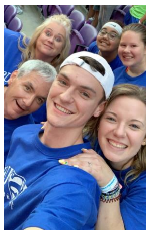
(Far L) Everyone received a backpack on the first day. 23,000 packs create quite a mountain of purple to behold! (Near L) A group shot of us just before the first night's Mass Event.