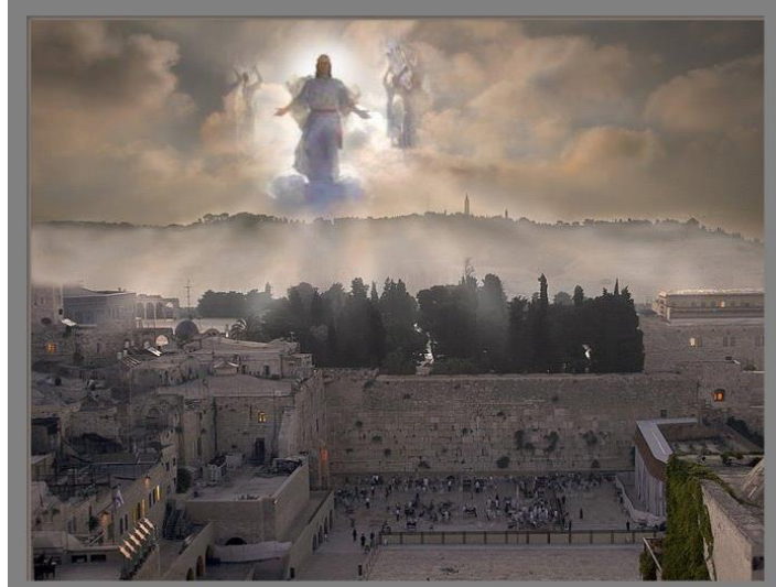
"On this Mountain"