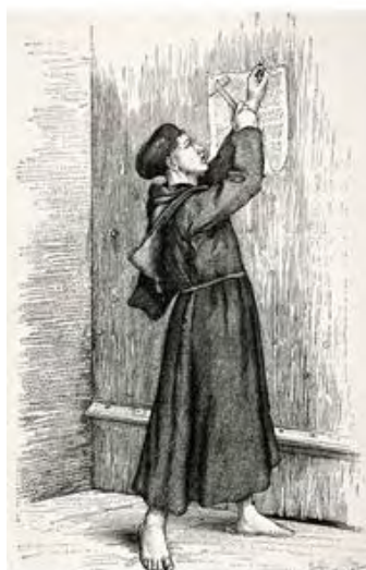
Martin Luther's 95 Theses, October 31, 1517