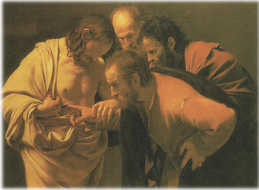
"The Doubting of St. Thomas" by Caravaggio